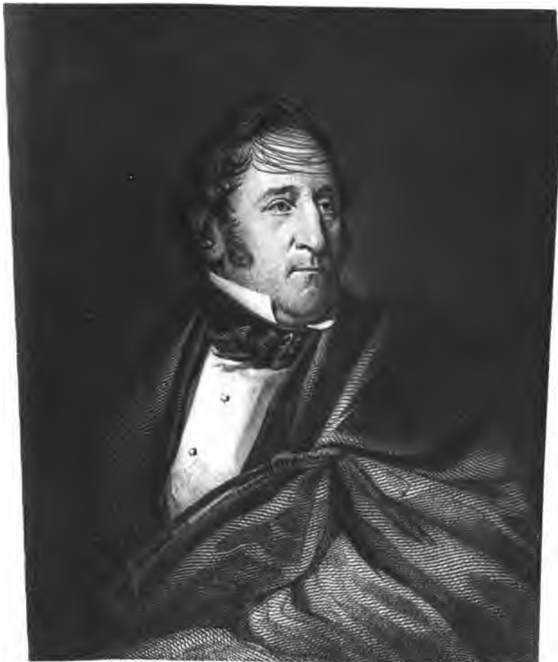
COLLEGE ANDREW - LIBRARY